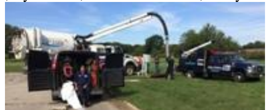
Village of Bradley Vactor Truck & Crew