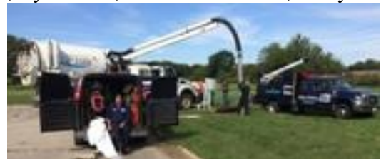
Village of Bradley Vactor Truck & Crew